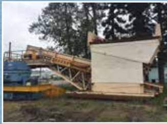
SL3052 20 Metre M & Q Primary Feed Bin: Complete with Grizzly, 800mm Belt Feeder & Bin Vibrators. Condition: As New.