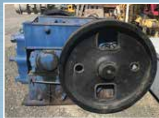
CR3029 800 x 670 Soest-Ferrum Double Drum Rolls Crusher: Complete with 1200 Diameter Pulleys - Smooth Drum. Condition: Excellent.

FOR FULL STOCK LIST & PHOTOGRAPHS SEE WEBSITE