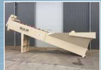
WE3008 100 TPH M & Q Equipment Sand Screw: Model MQ XL-100 – Fixed Unit – Complete with 11 KW Electric Drive Motor. Condition: New.