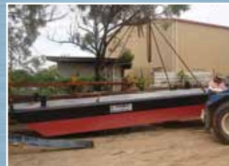
DP3033 2.5M x 7.5M Custom Work Barge: Complete with 40 HP Engine – Class 2D Survey for (4) Persons. Condition: Excellent.