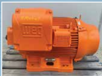
EM4547 55 KW Weg 2 Poole Electric Motor: 2970 RPM