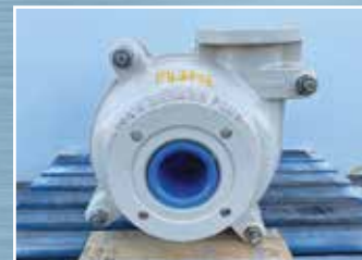
PU3692 4/3 CAH Warman Slurry Pump: Metal Lined - Metal Impeller - Metal Centrifugal Seal.