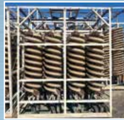
MP3151 WW6E Mineral Technologies Cleaner Spirals: Bank of 8 Spirals – Twin Start – 18 Banks Available. Condition: Good.

FOR FULL STOCK LIST & PHOTOGRAPHS SEE WEBSITE