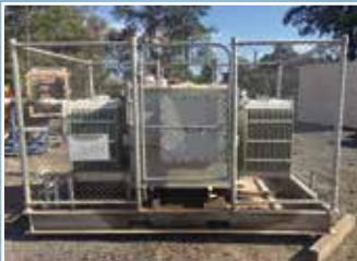
EL3300 2500 KVA EPE Transformer: 11000 to 415 Volts – Dyn11 – Complete with Galvanised Skid & Mesh Fence.