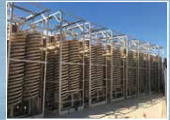
MP3141 MG7S Mineral Technologies Spirals: Bank of 8 Spirals – Triple Start – 19 Banks Available. Condition: Very Good.