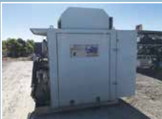
SU3092 52 HP Oil Lift/Isuzu Diesel Hyd Power Pack: Isuzu 2.2 Litre Engine – 80cc Kawasaki Pump. Condition: Excellent.