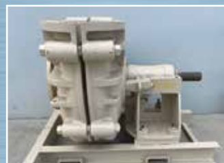
PU3700 12/10 EM Warman Slurry Pump: Rubber Lined - Rubber Impeller - Centrifugal Seal.