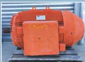
EM4491 220 KW CMG 6 Pole Electric Motor: 990 RPM - TEFC.