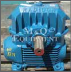
GB3379 10" Radicon Gear Box: Worm & Wheel – MBU10 – Ratio 60 to 1.