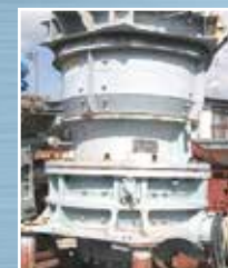
CC3082 800 Kawasaki Cone Crusher: Model KM-1008G - 100mm Feed Opening. Condition: Very Good.