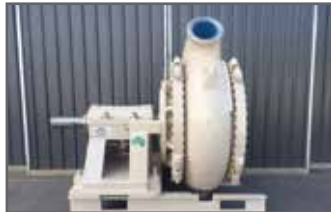
PU3481 12/10 GGH Austral Dredge Pump: Metal Lined - Metal Impeller - Gland Seal.

FOR FULL STOCK LIST & PHOTOGRAPHS SEE WEBSITE