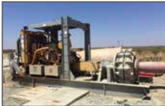
PU3460 10/8 Warman/Cat Pump Set: Warman 10 x 8 FAH / Caterpillar.