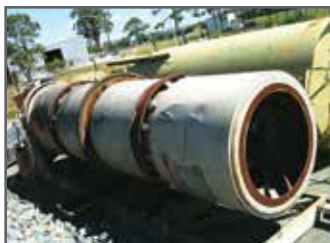
KD3018 1800 x 7600 Rotary Dryer: Complete with Drive & Feed Conveyor. Condition: Very Good.