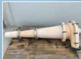
CY3095 250 CVX Weir Warman Cyclone: Cavex – Rubber Lined. 4 Units Available. Condition: Unused.