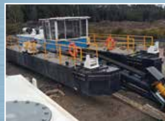
DP3022 10 x 8 SGH Dredge: Cutter Suction – 10/8 SGH Warman Pump – K19 Cummins – Winch Propelled. Condition: Very Good.