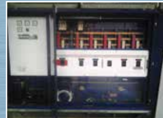
EB3071 1250 AMP Mechanical Serviced DB Board: 1000V - 1250 Amp Incoming Circuit Breaker - 5 x 400 Amp Outgoing - Complete with Galvanised Frame. Condition: Very Good.