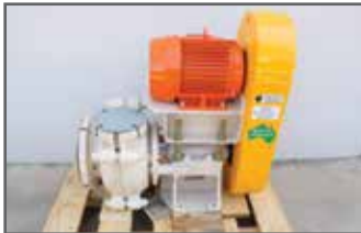
PU3655 3 CAHF Warman Froth Pump: Rubber Lined - Complete with C-CV Motor Base & 7.5 KW Drive. Condition: Fully Overhauled.