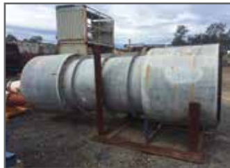
FA3049 110 KW Korfman/ Ausminco Mine Vent Fan: Twin 55 KW - 1000 Volts. Condition: Very Good.