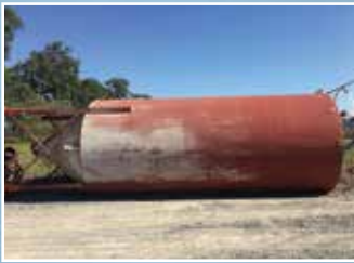
SL3062 55 Metre M & Q Silo: Complete with Baghouse & Bottom Fill Pipe. Condition: Very Good.