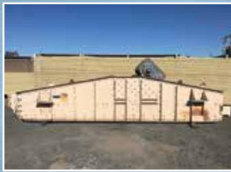
SC3220 2400 x 6100 x 1D Allis Chalmers/Svedala Screen: Low Head – Twin 4-3 Exciter. Condition: Excellent.