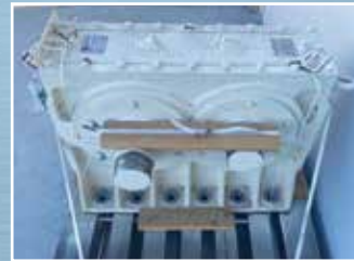
SE3230 HEV 100LS FL Smidth Screen Exciter: Complete with Breather. Condition: Unused.