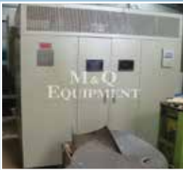
EL3156 1500 KVA ABB Transformer: 11000 to 430 Volts – Dyn1 – Dry Type.