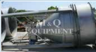
SL3043 12 Metre Silo: Overall Height 5.6M – Complete with Active Bottom. Condition: Very Good.