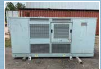
EL3375 1000 KVA Schneider Kiosk Transformer: 11000 to 433 Volts - Dyn11.