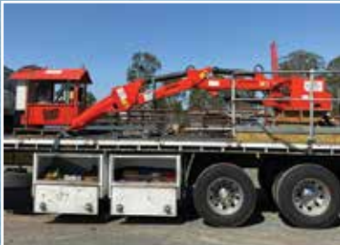
MP3153 C285 Rammer Primary Rock Breaker: Complete with 18.5 KW Power Pack. 2 Units Available. Condition: Refurbished

We have the largest stock of second hand WARMAN PUMPS in the world. Offered fully Refurbished in sizes from 1x3/4 up to 20/20. In the following models SC,AH,HH,M,L,D,G,GH,TC,GPS,SP.