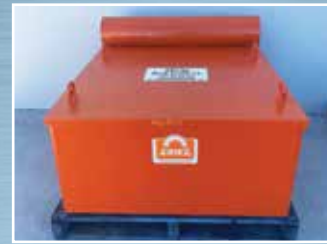
MG3115 SE740 Eriez Electro Magnet: Manual Cleaning – To suit 900mm Belt – Complete with Transformer Rectifier. Condition: Refurbished.