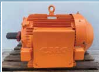
EM4550 55 KW CMG 6 Pole Electric Motor: 990 RPM - TEFC.