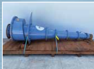
CY3089 20" FL Smidth Krebs Cyclone: GMAX20 - 3140. Condition: Unused.