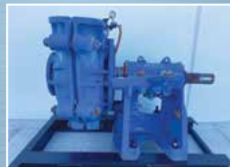
PU3715 8/6 FAH Warman Slurry Pump: Metal Lined - Metal Impeller - Gland Seal.