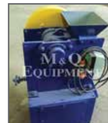
LE3019 8" x 5" Jaques Laboratory Jaw Crusher: Complete with Electric Motor & Stand. Condition: Excellent