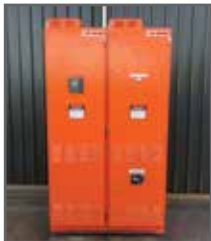
EZ3017 400 KVAR ABB Power Factor Correction: 415V - Complete with Circuit Breaker & Controller. Condition: As New.