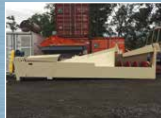
WE3026 175 TPH M & Q Equipment Fine Material Washer: Model MQ XL175 – Fixed Unit – Complete with 18.5 KW Electric Drive. Condition: New.