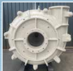
PU3721 14/12 FAH Warman Slurry Pump: Metal Lined - Metal Impeller.

FOR FULL STOCK LIST & PHOTOGRAPHS SEE WEBSITE