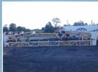
CV3087 750 x 18M Conveyor: Complete with Drive Motor & Torque Arm, Gear Box, Lagged Head Drum & Tail Take up. Condition: Excellent.