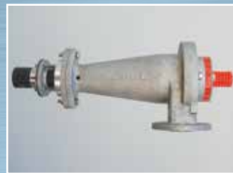
CY3058 3" Austral Cyclone: Rubber Lined – Capacity .5 to 1.5 Litres/Second @ 12 Micron Cut. Condition: New.