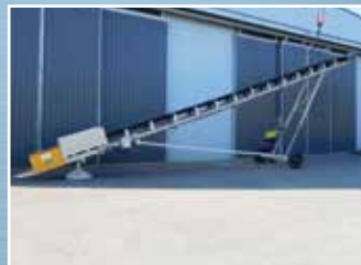
CV3096 600 x 15 Meter M & Q Radial Stacker: Complete with 4 KW Electric Drive - DOL Electric Starter, Lanyard Switches. Condition: New.