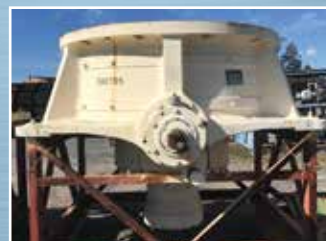
CC3098 1650 Unitech Cone Crusher: Complete with Electric Motor, Lube System & Hydraulics. 2 Units Available. Condition: Unused.