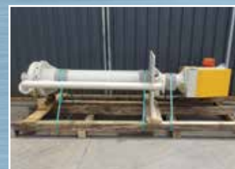
PU3684 3/3 QVTC-1800 Warman Sump Pump: Complete with Motor Base & Guard - 11 KW IP66 Hi Efficiency Motor. Condition: Overhauled.