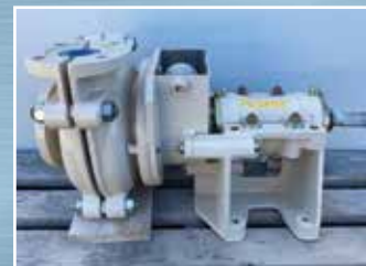
PU3696 2/1.5 Warman Slurry Pump: Metal Lined - Metal Impeller - Submerged Gland Seal.