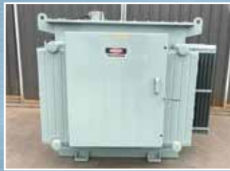
EL3355 1250 KVA Etel Transformer: 415 to 11000 Volts – YNyn0.