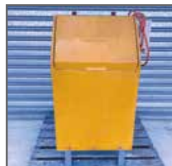
LE3028 LM1 Essa Lab Ring Mill: Complete with Bowl & Puck. Condition: Excellent.