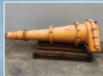
CY3085 400 CVX Weir Warman Cyclone: Cavex – Monolithic – Ceramic Lined. Condition: Excellent.