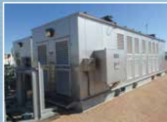
EL3314 4000 KVA Sycon Sub Station: 22000 to 433 Volts – Step Up/Step Down – Complete with HV & LV Switchgear