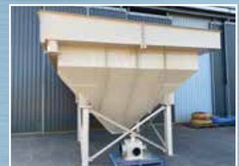
WE3020 4500 x 4500 Linatex Density Bin: 100 TPH Sand Washing Bin. Condition: Fully Refurbished.

FOR FULL STOCK LIST & PHOTOGRAPHS SEE WEBSITE