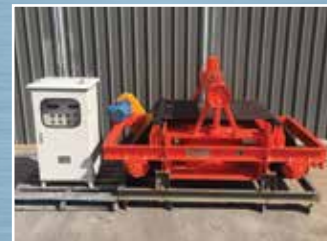
MG3112 800mm M & Q Electro Magnet: Model MQ RCDF-8 – Self Cleaning – Complete with Transformer Rectifier. Condition: New.