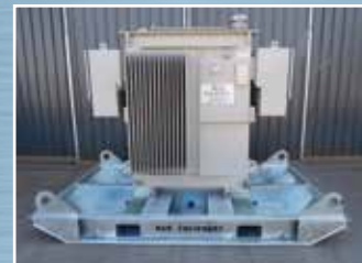
EL3379 500 KVA M & Q Equipment Transformer: 1000V to 415 Volts - YNyn0.