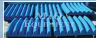
CS3006 48" x 42" DT Jaques Jaw Plates: Part Numbers AW1562; AW1563; AW1564; AW1565. Condition: Unused.