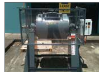
LE3016 550 x 700 Steve Co Lab Ball Mill: Complete with Water Cooling, 60L of 12mm Ceramic Charge & Ceramic Liners. Condition: Excellent.