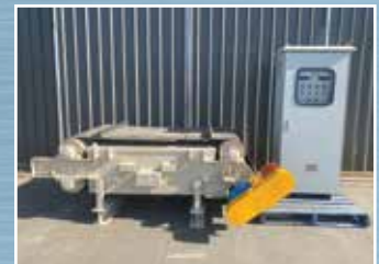
MG3117 55 Sturton Gill Electro Magnet: Model 55 – Inline – Self Cleaning – Complete with New Transformer Rectifier. Condition: Refurbished.