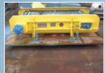
MG3081 800mm M & Q Tramp Magnet: Model RCY-C80 – Permanent Self Cleaning – Hydraulic Drive. Condition: New.