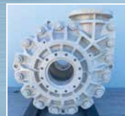
PU3714 8/6 FFAHP Warman Slurry Pump: Metal Lined - Metal Impeller.