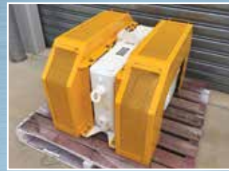
SE3172 JR408 Jost Screen Exciter: Complete with Counterweights & Guards. Condition: Very Good.

FOR FULL STOCK LIST & PHOTOGRAPHS SEE WEBSITE