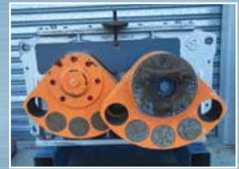
SE3216 DF601S Schenck Screen Exciter: Complete with Counterweights & Transport Frame. Condition: Very Good