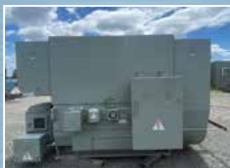
ER3141 1750 KW Toshiba 6 Pole Electric Motor: 980 RPM - 110000 Volts.