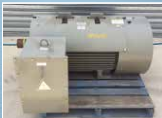
EM4443 250 KW Toshiba 4 Pole Electric Motor: 1480 RPM - TEFC.