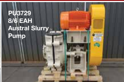
PU3729 8/6 EAH Austral Slurry Pump