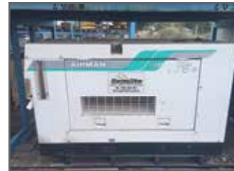
SU3087 175 CFM Airman Air Compressor: Model DDS175S – Diesel Power. Condition: Very Good.