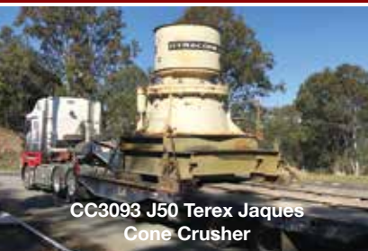
CC3093 J50 Terex Jaques Cone Crusher