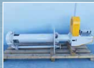
PU3713 65 QV SP Warman Sump Pump: Metal Lined - 1500 Leg.