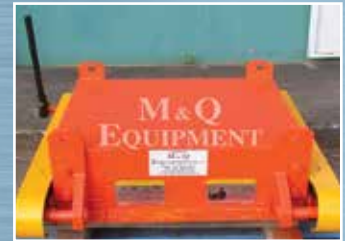
MG3109 600mm M & Q Tramp Magnet: Model MQ RCY-P65 – Manual Clean. Condition: New.