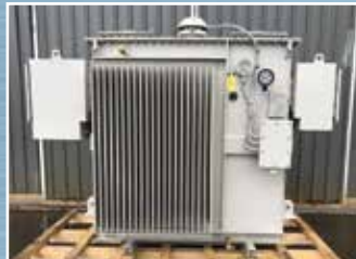
EL3362 1500 KVA M & Q Transformer: 11000 Volts to 1000 Volts – Dyn11.