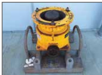
LE3025 300 Wescone Lab Cone Crusher: Model W300/2 - Minimum CSS 2mm. Condition: Very Good.

FOR FULL STOCK LIST & PHOTOGRAPHS SEE WEBSITE