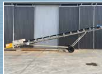
CV3090 600 x 12M M & Q Radial Stacker: Complete with 4 KW Electric Drive - DOL Starter - Lanyard Switches. Condition: New.