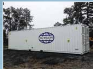
AT3051 1700 KVA Perkins / FG Wilson Generator Set: Perkins V16 Quad Turbo Engine - 1300 Hours - Complete with Control Panel & Exhaust. Condition: Excellent.