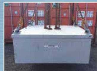
MG3092 89 Dings Sturton Gill Electro Magnet: Model 890HSM – Complete with Controller. Condition: Very Good.