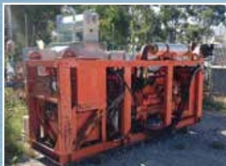
SU3080 200 HP Caterpillar Diesel Hyd Power Pack: CAT 3306 Engine – 2 Large & 1 Small Hydraulic Pumps. Condition: Very Good.