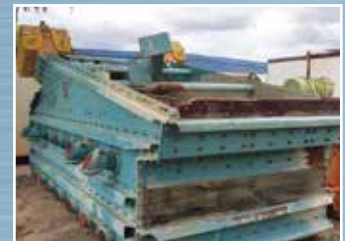
SC3165 – 2400 x 4800 x 2D Ludowici MPE Screen: Horizontal Style – Complete with Twin 11 KW Motors, Springs & Mounts. Condition: Excellent.