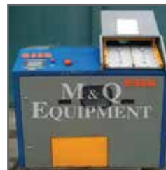
LE3017 Essa Micron Mill: Unit is PLC Controlled - Complete with Auto Sampling. Condition: As New