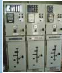
EB3082 YSF6 Yorkshire Circuit Breaker: 12 KV - 1250 Amps - 5 Units Available. Condition: Excellent.