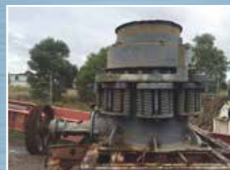
CC3088 36" STD HD Symons Cone Crusher: Complete with Motor & Lube System. Condition: Overhauled.