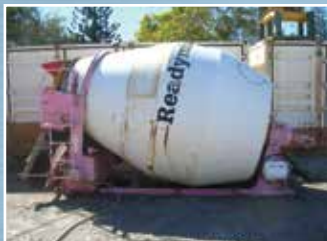
SU3079 5.5M Agitator: Complete with Hydraulic Drive Motor & Hydraulic Pump. Condition: Good.