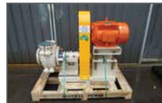
PU3541 4/3 CAH Austral Slurry Pump: Rubber Lined - Metal Impeller - Complete with C-ZV1 Style Motor Base & Guard - 22 KW Hi Efficiency Motor.

FOR FULL STOCK LIST & PHOTOGRAPHS SEE WEBSITE