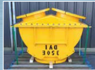
VA3108 350 DVI Valve: Table E Flange. Condition: New.