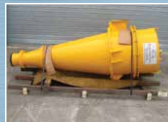
CY3060 675mm (27") Austral Cyclone: New