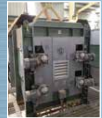
MP3118 HMD/Readings Induced Mag Roll Separator: Model IMRS 2-2-750. Condition: As New.