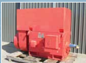
EM4399 600 KW Teco 4 Pole Electric Motor: 1485 RPM - 3300 Volts - CACA.