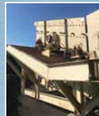
SC3221 12 x 5 x 3D Hawk Screen: Complete with Stand, Walkways, Chute & Underflow Conveyor. Condition: Excellent.