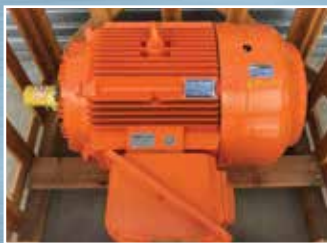
EM4483 90 KW Teco 4 Pole Electric Motor: 1480 RPM - TEFC. Condition: New