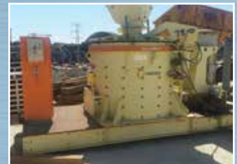
CI3051 A700 Metso Barmac Vertical Shaft Impactor: Complete with Electric Motor, Electric Starter & Stand. Condition: Excellent.