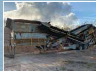
SC3233 10 x 5 x 2D Power Screen Screening Plant: Chieftan – Mounted on Twin Axles. Condition: Good