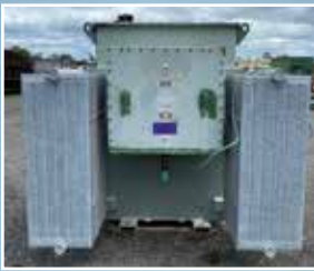
EL3373 1500 KVA Wilson Transformer: 11000 to 433 Volts – Dyn11.