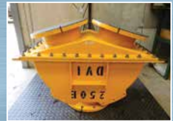
VA3119 250 DVI Valve: Table E Flanges.