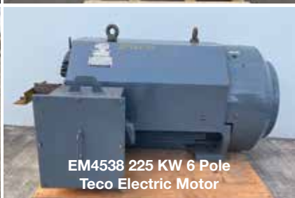
EM4538 225 KW 6 Pole Teco Electric Motor

CRUSHERS • FEEDERS • SCREENS • CONVEYORS TRANSFORMERS • GENERATORS • ELECTRIC MOTORS GEAR BOXES • CONVEYORS • PUMPS • BALL MILLS • DRYERS