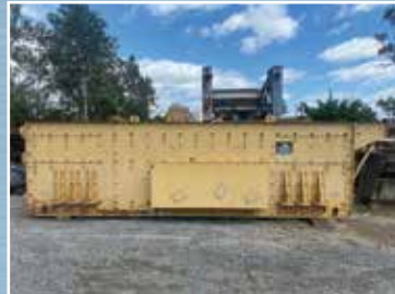
SC3232 20 x 8 x 3D Trio Screen: Model TTH8203 – Complete with Sub Frame & Electric Motor. Condition: Very Good