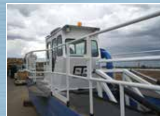
DP3029 8 x 6 Mudcat Dredge: Model MC-915 – Complete with 8 x 6 Clyde Morris Pump, 6-71 GM Diesel Motor & Auger Style Cutting Head. Condition: Good.