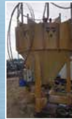
MP3126 IPJ 2400 Gekko Inline Pressure Jig: Complete with Controller. Condition: Very Good.