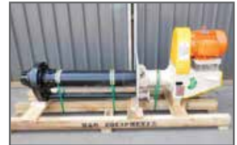
PU3563 40 PV SPR-1200 Austral Sump Pump: Rubber Lined - Complete with 5.5 KW IP66 Motor, V-Belts & Pulleys.