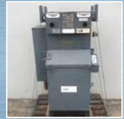
EB3095 12 KV Lucy Ring Main Unit: FRMU MK1A - 630/200 Amp. Condition: Very Good.