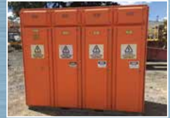
EB3080 2500 AMP Integra Switchboard: Current 2500 Amps - 415 Volts. Condition: As New.