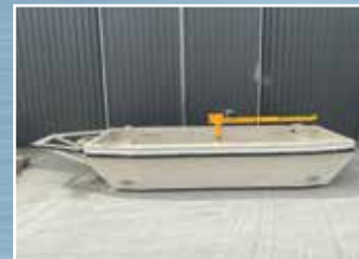
DP3035 2.4M x 5.0M M & Q Work Boat: Steel Barge – Complete with Outboard Motor & 12V Lifting Jib. Condition: Refurbished.