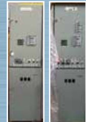
EB3040 800 AMP Reyrolle Circuit Breaker: Rated 12 KV-25 KA. 4 Banks Available. Condition: Unused.