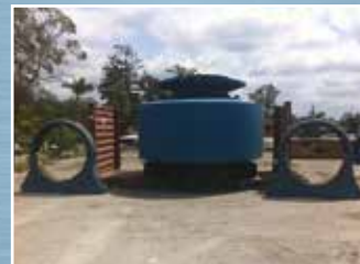
CG3060 4000 x 1600 Svedala Sag Mill: Complete with 250 KW Drive - Metal Liners - Manuals & all Associated Equipment. Condition: As New.