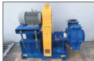
PU3538 6/4 DAH Warman Slurry Pump: Metal Lined - Metal Impeller - Gland Seal - On ZV Base - Complete with 15 KW Motor. Condition: Unused.