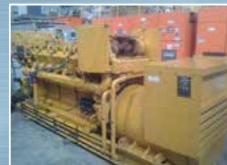
AT3056 875 KVA Caterpillar Generator Set: CAT D399 Engine - 490 hours - Complete with Control Panel, Heat Exchanger - Ex Standby. Condition: Excellent.