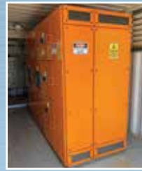
EB3097 3200 AMP Switchboard: Consists of Incoming & Distribution C/B's - Mounted in 20' Container. Condition: Very Good.

FOR FULL STOCK LIST & PHOTOGRAPHS SEE WEBSITE