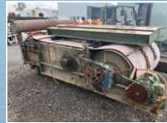
MG3114 SE790 Eriez Electro Magnet: Self Cleaning – Complete with Controller. Condition: Good.