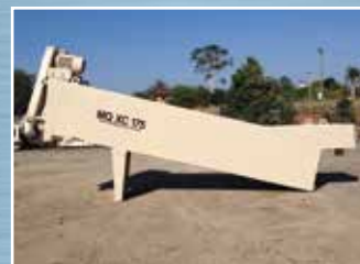
WE3023 175 TPH M & Q Equipment Coarse Material Washer: Model MQ XC175 – Complete with 22 KW Electric Motor. Condition: New.