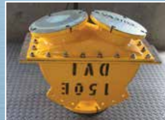
VA3102 150 DVI Valve: Table E Flange. Condition: New.