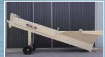
WE3027 100 TPH M & Q Equipment Sand Screw: Model MQ XL-100 – Mobile Unit – Complete with Hydraulic Drive. Condition: New.