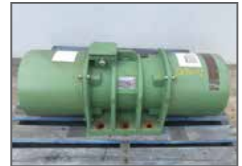
SU3097 4.0 KW Schenck Vibrating Motor: 980 RPM. Condition: Unused.

FOR FULL STOCK LIST & PHOTOGRAPHS SEE WEBSITE