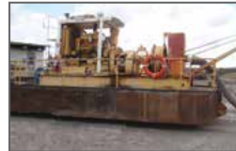
PU3577 8/6 FHX Multiflo Warman Diesel Pump Set: Model MFV-W390B - Complete with CAT3406 TA Engine - Skid Base, Pontoon & Boom - Suction Head. Condition: Very Good.