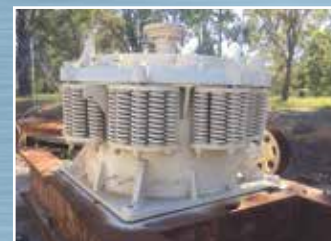
CC3079 36" STD HD Minyu Cone Crusher: Model MCC36 - Complete with Base Frame. Condition: Very Good.