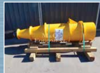
CY3077 18" Linatex Cyclone: Fully Refurbished – Complete with Fishtail.