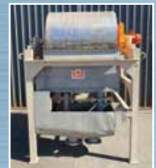
MP3152 914 x 1000 Eriez Wet Drum Magnetic Separator: Complete with Gear Motor Drive. Condition: Refurbished.