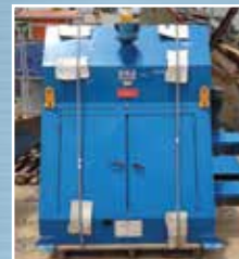
MP3120 Eriez Rare Earth Mag Roll Separator: Model RE40-2 – Complete with Control Box. Condition: As New.