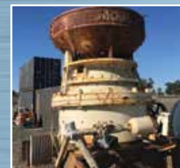
CC3095 G35 Jaques Cone Crusher: Complete with Electric Motor & Lube System. Condition: Very Good.