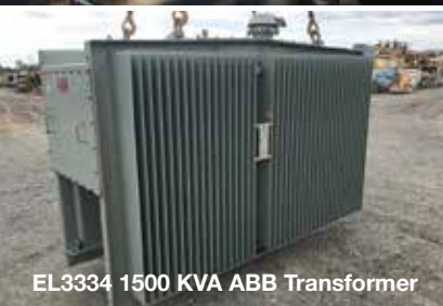
EL3334 1500 KVA ABB Transformer