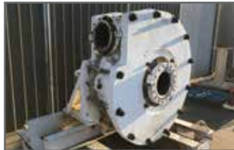
PU3637 10/8 FF GHP Warman Dredge Pump: Metal Lined - Metal Impeller - Gland Seal.