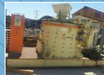
CI3051: A700 Metso Barmac Vertical Shaft Impactor: Complete with Electric Motor, Electric Starter & Stand. Condition: Excellent.