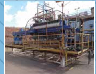
MP3135: 1200 x 1200 JWI Filter Press: 39 Plate. Condition: Excellent.