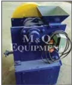
LE3019: 8" x 5" Jaques Laboratory Jaw Crusher: Complete with Electric Motor & Stand. Condition: Excellent.

FOR FULL STOCK LIST & PHOTOGRAPHS SEE WEBSITE