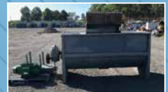
MX3045: 2000 Litre Arenco Ribbon Mixer: 2400 Long x 1070 Wide x 1100 High - Stainless steel - Complete with 22 KW Drive Motor. Condition: Excellent.