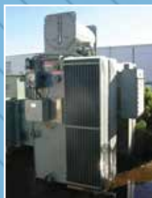
EL3178: 1500 KVA Wilson Transformer: 22000 / 11000 to 6600 Volts - Dyn11.