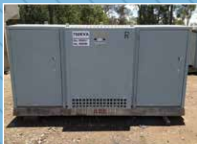
EL3258: 750 KVA ABB Kiosk Transformer: 11000 to 433 Volts - Dyn11 Complete with HV Switch & LV Fuses.