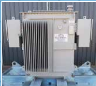
EL3366: 1000 KVA M & Q Transformer: 1000 Volts to 415 Volts - Yyn0.