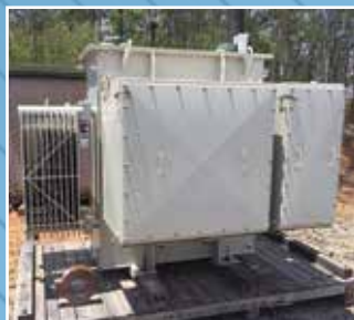
EL3289: 1600 KVA Schneider Transformer: 11000 to 415 Volts - Dyn11.