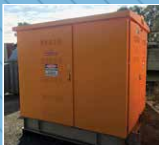
EL3347: 1250 KVA Trafo Electro Transformer: 22000 to 415 Volts - Dyn11 Complete with LV Switchgear.