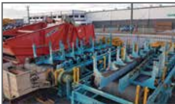
FE3061: 1500 x 7500 Bateman Kinhill Belt Feeder: Complete with 30 KW Planetary Drive. Condition: Excellent.

FOR FULL STOCK LIST & PHOTOGRAPHS SEE WEBSITE