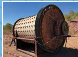
CG3068: 3000 x 4000 ANI Ruwolt Ball Mill: Metal Lined - Complete with 400 KW Electric Motor, Gear Box, Clutch, Sole Plates & Spares. Condition: Very Good.