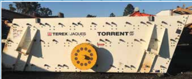
SC3206: 20 x 8 x 3D Terex Jaques Screen: Torrent - Complete with Springs & Electric Drive. Condition: Excellent.