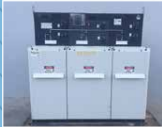
EB3069: RM6 Schneider Ring Main Unit: 12KV - 630 Amp. Condition: New/Unused.