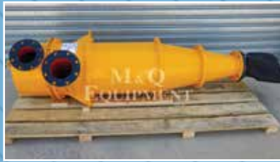
CY3077: 18" Linatex Cyclone: Fitted with Extended Feed Box - Complete with Fishtail.