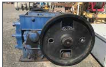
CR3029: 800 x 670 Soest-Ferrum Double Drum Rolls Crusher: Complete with 1200 Diameter Pulleys – Smooth Drum. Condition: Excellent.