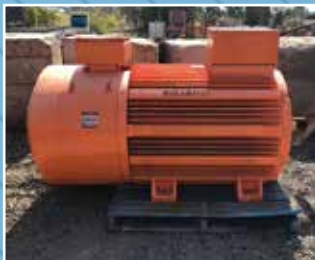
ER3130: 400 KW 4 Pole ABB Electric Motor: 1480 RPM - TEFC.