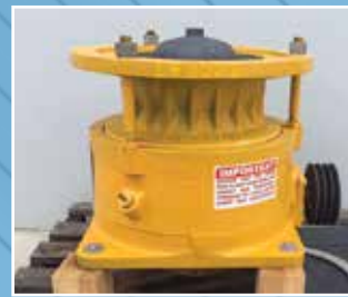
LE3022: 300 Wescone Lab Cone Crusher: Model W300-2 - Maximum Feed 50mm - Minimum CSS 2mm. Condition: Unused.

FOR FULL STOCK LIST & PHOTOGRAPHS SEE WEBSITE