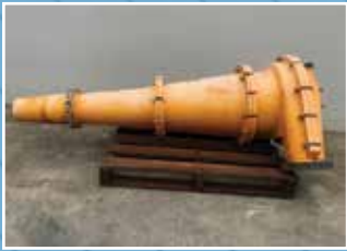
CY3085: 400 CVX Weir Warman Cyclone: Cavex - Monolithic - Ceramic Lined. Condition: Excellent.