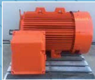
EM4469: 200 KW 4 Pole Toshiba Electric Motor: 1480 RPM - TEFC.