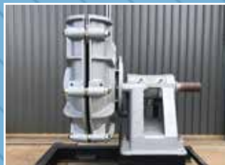
PU3581: 14/12 GAH Warman Slurry Pump: Metal Lined - Metal Impeller. Condition: Fully Refurbished.