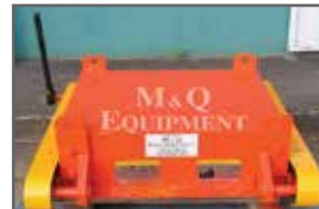
MG3108: 600mm M & Q Tramp Magnet: Model MQ RCY-P65 - Manual Clean. Condition: New.