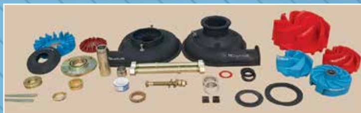
PARTS TO SUIT SC PUMPS

WE WILL MEET OR BEAT ANY COMPETITORS PRICES