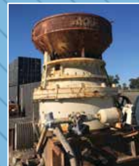
CC3095: G35 Jaques Cone Crusher: Complete with Electric Motor & Lube System. Condition: Very Good.