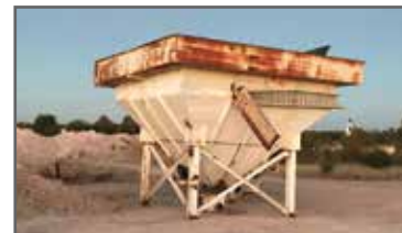
WE3020: 4500 x 4500 Linatex Density Bin: 100 TPH Sand Washing Bin.