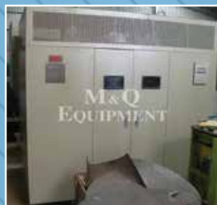
EL3156: 1500 KVA ABB Transformer: 11000 to 433 Volts - Dyn1 - Dry Type.