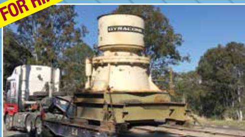
CC3093: J50 Terex Jaques Cone Crusher: Complete with Motor, Lube System & Base Frame. Condition: Excellent.