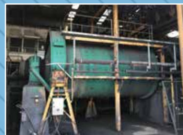
CG3071: 2970 x 5610 ANI Ruwolt Ball Mill: Rubber Lined - Complete with 710 KW Electric Motor, Gear Box, Control Room, Side Plates & Spares. Condition: Excellent.