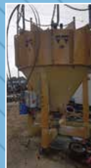
MP3126: IPJ2400 Gekko Inline Pressure Jig: Complete with Controller. Condition: Very Good.