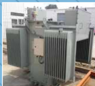
EL3344: 1750 KVA Schneider Transformer: 22000 to 433 Volts - Dyn11.