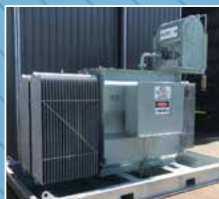
EL3330: 2500 KVA Alstom Transformer: 11000 to 433 Volts - Dyn11.