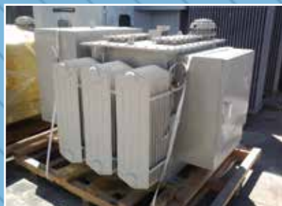
EL3283: 1000 KVA Transformer: 11000 to 415 Volts - Dyn11.