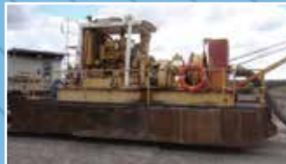
PU3577: 8/6 FHX Multiflo Warman Diesel Pump Set: Model MFV-W390B - Complete With CAT 340 GTA Engine - Skid Base, Pontoon & Boom - Suction Head. Condition: Very Good.