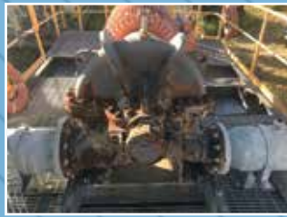
PU3520: 200 x 250 x 630 Dowdens/Super Titan Pontoon Pump: Complete with Pontoon, Pump, Motor & Switchboard. Condition: Excellent.