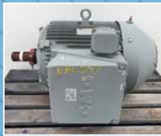
EM4507: 45 KW 4 Pole CMG Electric Motor: 1480 RPM - TEFC.