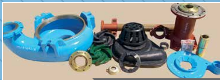
PARTS TO SUIT SUMP PUMPS