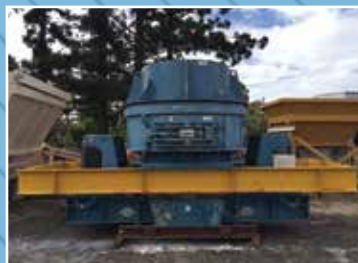
CI3047: 8100 Metso Barmac Vertical Shaft Impactor: B8100DD – Dual Drive – Complete With Anti Vibration Frame. Condition: Very Good.