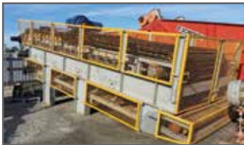
FE3054: 2400 x 7000 Minspec Apron Feeder: 30 KW Planetary Drive - Spill Conveyor. Condition: Unused.