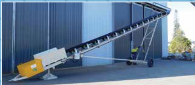
CV3096: 600 x 15 Metre M & Q Radial Stacker: Complete with 4 KW Electric Drive, Lanyard Switches. Condition: New.