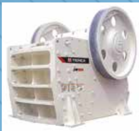
CJ3077: 55" x 32" Terex Jaques Jaw Crusher: Single Toggle – Model JW55. Condition: New.