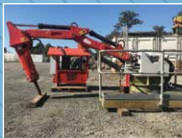
MP3139: BB 285 Rammer Hydraulic Rock Breaker: Complete with 777 Hammer – 18.5 KW Power Pack & Platform with Handrails. Condition: As New.