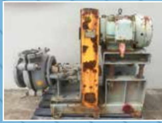
PU3606: 3 C-AHF Warman Froth Pump: Rubber Lined - Metal Impeller - Gland Seal. Condition: Very Good.