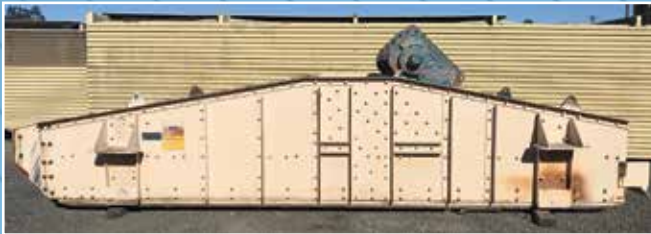
SC3220: 2400 x 6100 x 1D Allis Chalmers/Svedala Screen: Low Head - Twin 4-3 Exciter. Condition: Excellent.