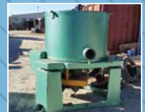
MP3121: 30" CD Knelson / Consep Concentrator: Centre Discharge - Complete with Electric Motor. Condition: Workshop Checked.