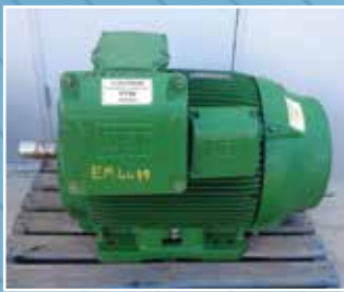
EM4419: 90 KW 2 Pole Weg Electric Motor: 2980 RPM - TEFC.