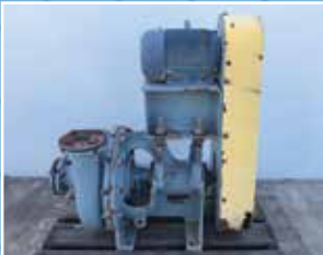
PU3598: 3/3 TC Warman Cyklo Pump: Complete with Motor Base, Guard, 4 KW Electric Motor. Condition: Unused.