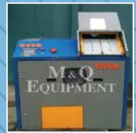
LE3017: Essa Micron Mill: Unit is PLC Controlled - Complete with Auto Sampling. Condition: As New.