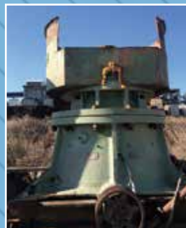
CC3094: G50 Jaques Cone Crusher: Complete with Electric Motor & Lube System. Condition: Very Good.