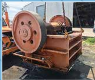
CJ3080: 1300 x 300 Jian She Granulator: Single Toggle – Roller Bearing. Condition: Excellent.