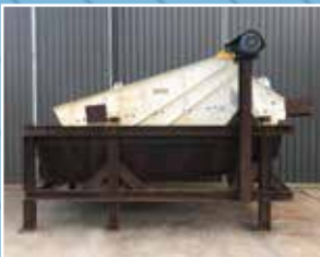
SC3217: 1800 x 3700 x 1D Honert Screen: Complete with Stand, Sump, Drive & Discharge Tray. Condition: Excellent.