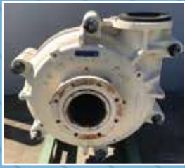
PU3610: 8/6 EAH Warman Slurry Pump: Metal Lined - Metal Impeller - Metal Centrifugal Seal. Condition: Excellent.