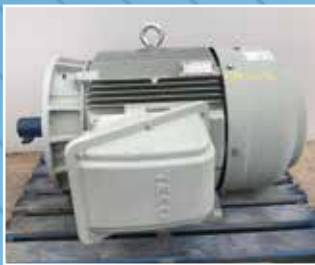
EM4496: 90 KW 4 Pole Teco Electric Motor: 1480 RPM - Foot/Flange.