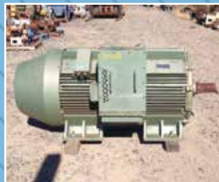
EM4430: 630 KW 6 Pole Pope Electric Motor: 990 RPM - 3300 Volts.