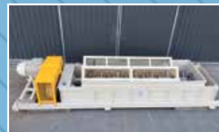
MX3040: 1200 x 3500 CRE Pug Mill: Complete with 75 KW Drive - Rated at 450 TPH. Condition: Excellent.