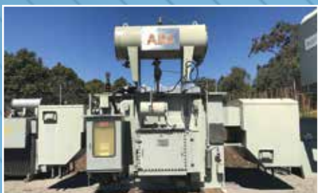
EL3327: 15000 KVA ABB Transformer: 33000 to 11000 Volts - Dyn11 Complete with OLTC.