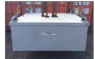
MG3092: 89 Dings Sturton-Gill Electro Magnet: Model 890HSM - Complete with Controller. Condition: Very Good.

FOR FULL STOCK LIST & PHOTOGRAPHS SEE WEBSITE