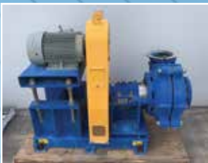
PU3538: 6/4 DAH Warman Slurry Pump: Metal Lined - Metal Impeller - Gland Seal - On ZV Base - Complete with 15 KW Motor. Condition: Unused.