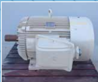
EM4415: 75 KW 6 Pole Teco Electric Motor: 980 RPM - TEFC.