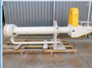
PU3590: 6/4 RV-TC Warman Sump Pump: 2100 Leg - New Wet End - New Bearings - New Discharge Pipe etc.