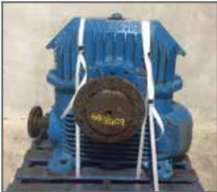
GB3409: 14" Radicon Gear Box: Worm & Wheel - MBU14 - Ratio 40:1 Condition: Very Good.