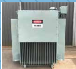
EL3333: 1500 KVA ABB Transformer: 11000 to 433 Volts - Dyn11.