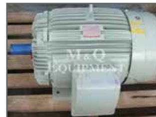
EM4354: 30 KW 2 Pole Teco Electric Motor: 2955 RPM - TEFC.

FOR FULL STOCK LIST & PHOTOGRAPHS SEE WEBSITE