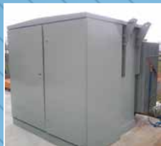
EL3262: 2500 KVA Aset Kiosk Transformer: 22000 to 433 Volts - Dyn11.