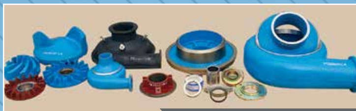
PARTS TO SUIT ASC PUMPS