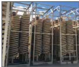
MP3141: MG7S Mineral Technologies Spirals: Bank of 8 Spirals - Triple Start 20 Banks Available. Condition: Very Good.

FOR FULL STOCK LIST & PHOTOGRAPHS SEE WEBSITE