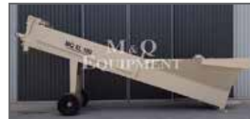
WE3007: 100 TPH M & Q Equipment Sand Screw: Model MQ XL100 - Mobile Unit complete with Hydraulic Drive. Condition: New.