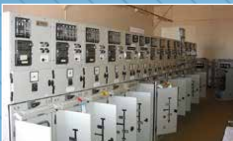
EB3024: YSF6 Yorkshire Circuit Breaker: 12KV - 630 Amps - 9 Units Available. Condition: Excellent.