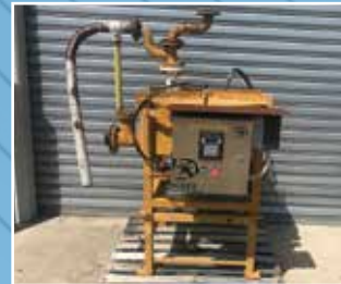
MP3142: ISP02 Gekko Inline Pressure Jig: Inline Spinner - Complete with Controller. Condition: Excellent.