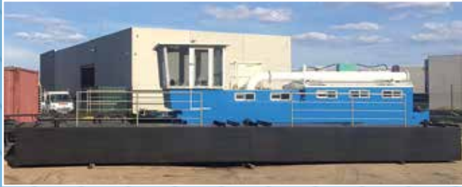
DP3022: 10 x 8 SGH Dredge: Cutter Suction - 10/8 SGH Warman Pump - K19 Cummins - Winch Propelled. Condition: Fully Refurbished.