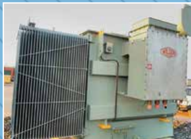
EL3356: 10000 KVA Wilson Transformer: 22000 to 6600 Volts - Dyn11.