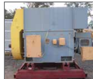
ER3126: 1000 KW 6 Pole Toshiba Slipring Electric Motor: 985 RPM - CACA.