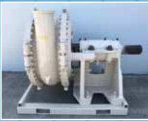
PU3536: 8/6 FFHX Warman Slurry Pump: Metal Lined - Metal 4 Vane Impeller - Gland Seal. Condition: Fully Refurbished.