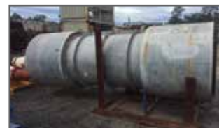
FA3049: 110 KW Korfman/Ausminco Mine Vent Fan: Twin 55 KW - 1000 Volts. Condition: Very Good.