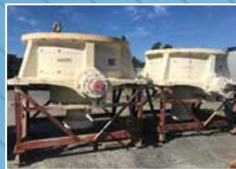
CC3097-CC3098: 1650 Unitec Cone Crusher: Complete with Motor, Lube System & Hydraulics. Condition: Unused - 2 Units Available.

FOR FULL STOCK LIST & PHOTOGRAPHS SEE WEBSITE