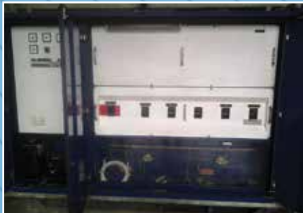
EB3071: 1250 Amp Mechanical Services DB Board: 1000V - 1250 Amp incoming Circuit Breaker - 5 x 400 Amp Outgoing - Complete with Galvanised Frame. Condition: Very Good.