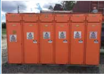
EB3078: 2500 Amp Integra Switchboard: Current 2500 Amp - 415 Volts. Condition: As New.