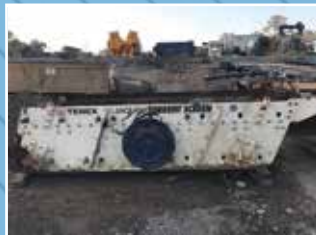
SC3204: 12 x 5 x 2D Jaques Terex Screen: Complete with Springs & Mounts. Condition: Very Good.