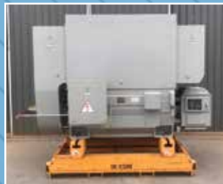
ER3138: 800 KW 6 Pole Toshiba Electric Motor: 985 RPM - 6600 Volts.

FOR FULL STOCK LIST & PHOTOGRAPHS SEE WEBSITE