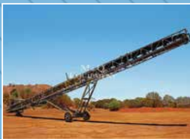
CV3095: 1200 x 24M Striker Radial Stacker: Hire Unit – Electric Drive – Model ST2412 – wheel Mounted. Condition: Excellent.

We have the largest stock of second hand WARMAN PUMPS worldwide. Offered fully Refurbished in sizes from 1x3/4 up to 20/20. In the following models SC,AH,HH,M,L,D,G,GH,TC,GPS,SP.