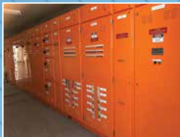
CP3028: Crushing Plant Switchroom 1250Amp SJ Electric Main Switchboard: Complete with 40" Switchroom – CT Metering – 4 Crusher Starters – 2 Screen Starters – Conveyor Starters & DB Section. Condition: Like New.