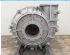
PU3583: 12/10 FFAH Warman Slurry Pump: Rubber Lined - Rubber Impeller - Centrifugal Seal. Condition: Overhauled.