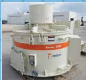
CI3048: VI200 Metso Barmac Vertical Shaft Impactor: Complete with 132 KW Drive. Condition: Unused.