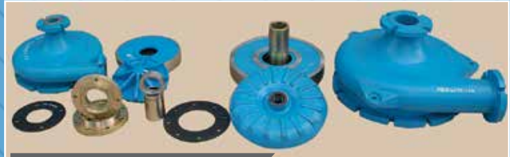
PARTS TO SUIT TC PUMPS