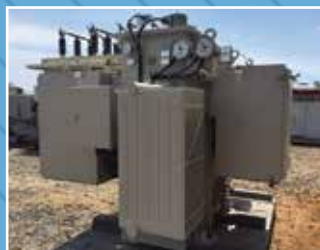
EL3290: 1600 KVA SCHNEIDER TRANSFORMER: 11000 to 415 Volts – Dyn11