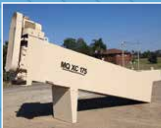
WE3015: 175 TPH M & Q EQUIPMENT COARSE MATERIAL WASHER: Model MQXC175 - Complete with 22 KW Electric Motor. Condition: New