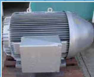
EM4347: 200 KW POPE ELECTRIC MOTOR: 970 RPM - TEFC