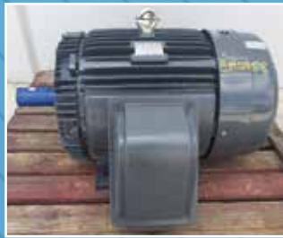
EM4458: 37 KW TECO ELECTRIC MOTOR: 1465 RPM - TEFC