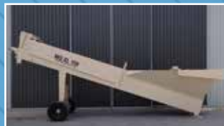
WE3007: 100 TPH M & Q EQUIPMENT SAND SCREW: Model MQ XL100 - Mobile Unit complete with Hydraulic Drive. Condition: New