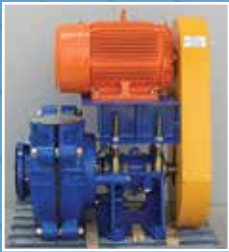
PU3443: 6 x 4 DAH Austral Slurry Pump: Rubber Lined - Rubber Impeller - Metal Centrifugal Seal - Complete with 30KW Motor - D-CV Style Base. Condition: New