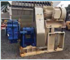
PU3473: 8 x 6 FAH WARMAN SLURRY PUMP: Metal Lined - Poly Impeller Gland Seal Condition: Very Good