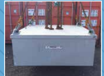
MG3092: 89 DINGS STURTON-GILL ELECTRO MAGNET: Model 890HSM - Complete with Controller. Condition: Very Good