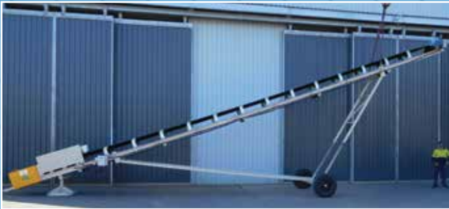
CV3088: 600 x 15M M & Q RADIAL STACKER: Complete with 4 KW Electric Drive - DOL Electric Starter, Lanyard Switches