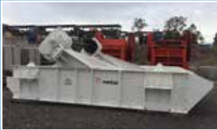
SC3167: 3000 X 4800 X1D METSO/SCREENIX SCREEN: Low Head - Dewatering Style - Twin 4-3 Exciters. Condition: As New