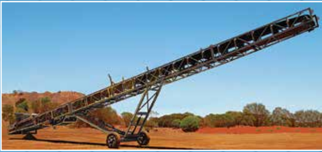
CV3094: 1200 x 24M STRIKER RADIAL STACKER: Electric Drive - Model ST2412 - Wheel Mounted. Condition: Excellent