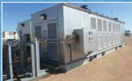
EL3314: 4000 KVA SYCON SUB STATION: 22,000 to 433 Volts – Step Up/Step Down – Complete with HV & LV Switchgear. Condition: As New