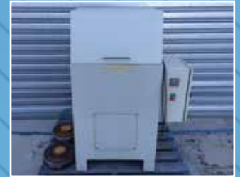
LE3024: ROCKLABS RING MILL: Complete with (2) Bowls & Pucks. Condition: Excellent