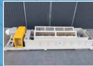
MX3040: 1200 x 3500 CRE PUG MILL: Complete with 75 KW Drive - Rated at 450TPH. Condition: Refurbished

WH3003 15 HP Joy Scraper Winch: Double Drum - Electric - Overhauled.