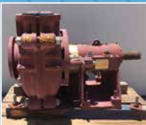
PU3494: 6 x 4 DDAH Weir Warman Slurry Pump: Poly Lined - Mechanical Seal. Condition: Appears Unused