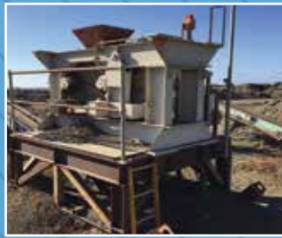
CR3025: 350 X 900 VAN GELDER ROLLS CRUSHER: Double Drum - Complete with Twin 5.5 KW Drives. Unit is Skid Mounted. Condition: Very Good