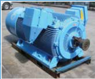
EM4364: 760 KW SIEMENS ELECTRIC MOTOR: 1490 RPM - 6600 Volts