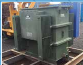
EL3305: 1000 KVA ETEL TRANSFORMER 1000 to 415 Volts – YNyn0 – Complete with Skid Base & 1000 Volt Switchboard