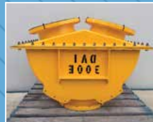
VA3111: 300 DVI VALVE: Table E Flanges. Condition: New