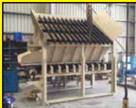
SL3059: 5 METER FINLAY FEED HOPPER Complete with 650mm Belt Feeder and Grizzly Bars