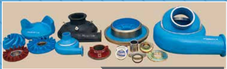
PARTS TO SUIT ASC PUMPS