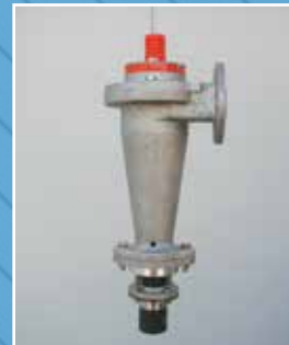
CY3058: 3" AUSTRAL CYCLONE: Rubber Lined - Capacity .5 to 1.5 Litres/Second @ 12 Micron Cut. Condition: New

THIS IS A SELECTION ONLY OF EQUIPMENT AVAILABLE