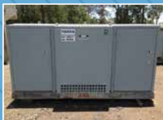
EL3258: 750 KVA ABB KIOSK TRANSFORMER: 11000 to 433 Volts - Dyn11 - Complete with HV Switch & LV Fuses