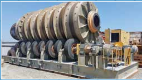
SC3153: 3192 x 8132 RCR TOMLINSON SCRUBBER/TROMMEL: Complete with Twin 185 KW Drives, Base Frame & Discharge Trommel. Condition: Very Good