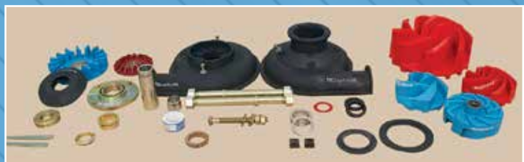
PARTS TO SUIT SC PUMPS

WE WILL MEET OR BEAT ANY COMPETITORS PRICES