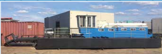
DP3022: 10 x 8 SGH Dredge Cutter Suction - 10/8 SGH Warman Pump - K19 Cummins - Winch propelled. Condition: Very Good