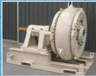
PU3437: 10 x 8 SGH Austral Dredge Pump: Metal Lined - Metal Impeller - Gland Seal - Hi Lift. Condition: New