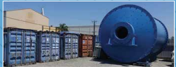
CG3064: 4200 x 6800 MORGARDSHAMMER SAG MILL: Complete with 1540 KW DC Drive – Gear Box, Pinion, Girth Gear, Rubber Liners, Starters, Transformer & Switch Room. Condition: Very Good