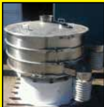
SC3115: 48" SWECO SCREEN. 2 and 3 DECK UNITS AVAILABLE

M&Q Equipment can offer a large range of hire equipment including: CONVEYORS, TRANSFORMERS, PUMPS, HOPPERS