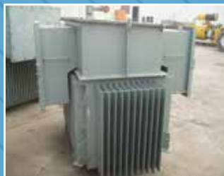
EL3180: 1000 KVA ABB TRANSFORMER: 11000 to 433 Volts – Dyn11