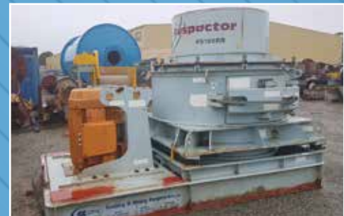
CI3049: VS100 RR AUSPACTOR VSI: Complete with 185 KW Weg Motor