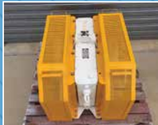
SC3172: JR408 JOST SCREEN EXCITER: Complete with Counterweights & Guard. Condition: Very Good