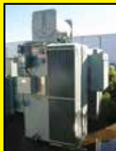
EL3178: 1500KVA WILSON TRANSFORMER 22kv/11kv TO 6.6kv