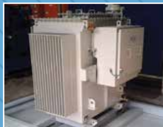
EL3291: 500 KVA M & Q EQUIPMENT TRANSFORMER: 1000 to 415 Volts – YNyn0 – Complete with Skid Base