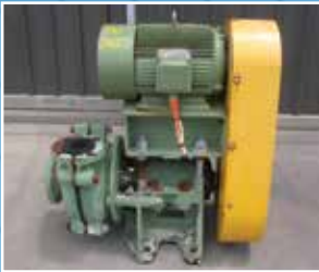
PU3427: 3 x 2 CAH WARMAN SLURRY PUMP: Rubber Lined - C-CV Motor Base - 4 KW Motor