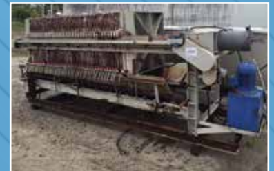
MP3122: 1000 X 1000 FILTER PRESS: 39 Plate - Poly Plates - Complete with Hydraulic Open/Close & Control Panel. Condition: Very Good