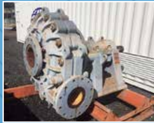
PU3488: 10 x 8 T AHPP Weir Warman Slurry Pump: Metal Lined - Metal Impeller - Mechanical Seal - Bareshaft. Condition: Overhauled