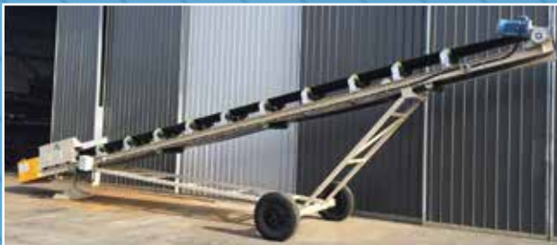
CV3090: 600 x 12M M & Q RADIAL STACKER: Complete with 4 KW Electric Drive - DOL Electric Starter - Lanyard Switches