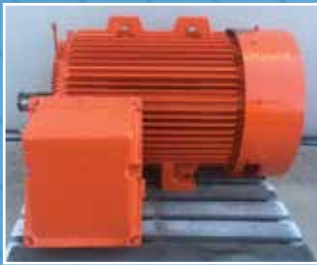
EM4469: 200 KW TOSHIBA ELECTRIC MOTOR: 1480 RPM - TEFC