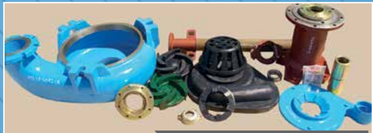
PARTS TO SUIT SUMP PUMPS