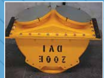
VA3103: 200 DVI Valve: Table E Flanges. Condition: New.