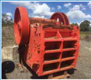
CJ3078: 54" x 32" TEREX JAUQUES JAW CRUSHER: Single Toggle - Model JW54. Condition: Very Good