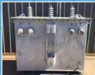
EL3309: 500 KVA ABB TRANSFORMER 11000 to 433 Volts – Dyn11