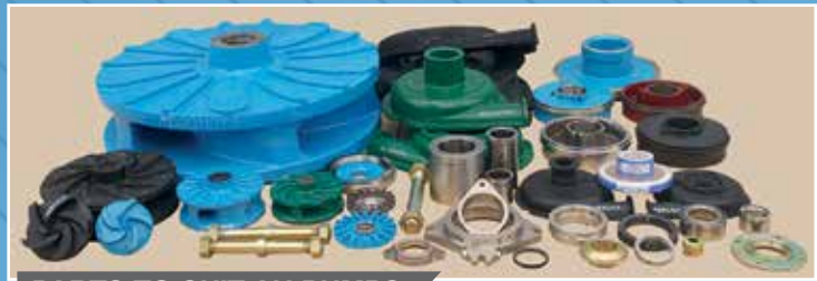
PARTS TO SUIT AH PUMPS

WE WILL MEET OR BEAT ANY COMPETITORS PRICES