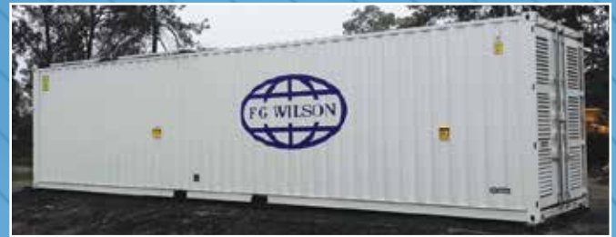
AT3050: 1700 KVA PERKINS/FG WILSON GENERATOR SET: Perkins V16 Quad Turbo Engine – 1267 Hours – Complete with Control Panel and Exhaust. Condition: Excellent

THIS IS A SELECTION ONLY OF EQUIPMENT AVAILABLE