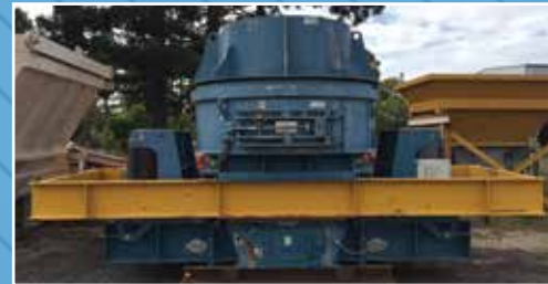
CI3047: 8100 METSO BARMAC VERTICAL SHAFT IMPACTOR: B8100DD – Dual Drive – Complete with Anti Vibration Frame. Condition: Very Good