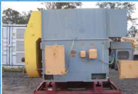
ER3126: 1000 KW TOSHIBA SLIPRING ELECTRIC MOTOR: 985 RPM - CACA - 3300 VOLTS - UNUSED