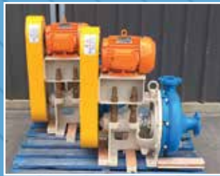
PU3475: 2/2 TC Austral Cyklo Pump: Complete with Motor Base - Guard - 3 KW Motor. Condition: New