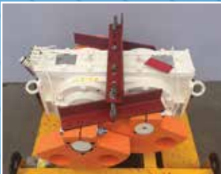
SC3158: HE65 HONERT FL SMIDTH SCREEN EXCITER: Complete with Counterweights & Transport Frame. Condition: Unused