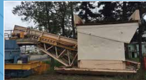
SL3052: 20 METRE M & Q PRIMARY FEED BIN: Complete with Grizzly, 800mm Belt Feeder & Bin Vibrators. Condition: As New