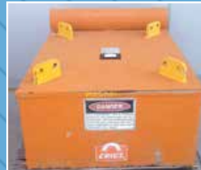
MG3084: SE745 ERIEZ MAGNET: Manual Cleaning - To suit up to 1050 Wide Belt. Condition: Very Good