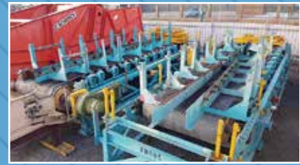
FE3061: 1500 x 7500 BATEMAN KINHILL BELT FEEDER: Complete with 30 KW Planetary Drive. Condition: Excellent

THIS IS A SELECTION ONLY OF EQUIPMENT AVAILABLE