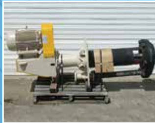
PU3310: 65 QV SPR Warman Sump Pump