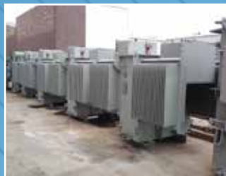
EL3229: 2000 KVA SCHNEIDER TRANSFORMER 6600 to 433 Volts – Dyn11