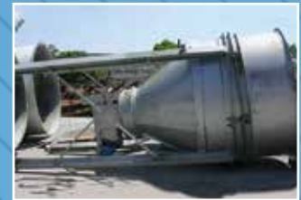
SL3043: 12 Metre Silo: Overall Height 5.6M - Complete with Active Bottom. Condition: Very Good.