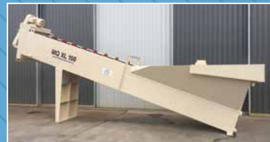
WE3008: 100 TPH M & Q Equipment Sand Screw: Model MQ XL-100 - Fixed Unit - Complete with 11 KW Electric Drive Motor. Condition: New.

THIS IS A SELECTION ONLY OF EQUIPMENT AVAILABLE