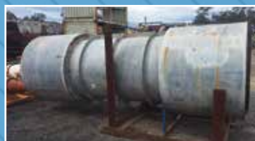
FA3049: 110 KW KORFMAN/ AUSMINCO MINE VENT FAN: Twin 55 KW - 1000 Volts. Condition: Very Good

THIS IS A SELECTION ONLY OF EQUIPMENT AVAILABLE