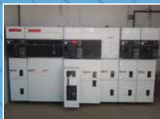
EB3067: 22 KV MERLIN GERIN METERING PANEL: Consisting of Incoming Switch - Metering - Main Circuit Breaker - 2 Outgoing Feeder Switches. Condition: Excellent