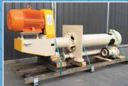
PU3275 65QVSP SUMP PUMP: Metal Lined – 1500 Leg.

THIS IS A SELECTION ONLY OF EQUIPMENT AVAILABLE