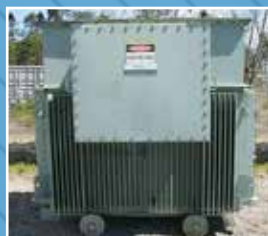
EL3202: 1500 KVA ABB TRANSFORMER: 11000 to 415 Volts - Dyn11, Condition: Excellent