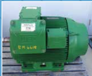
EM4418: 90 KW WEG ELECTRIC MOTOR: 2980 RPM - TEFC