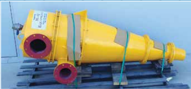
CY3063: 24" LINATEX CYCLONE: Complete with Fishtail. Condition: Excellent