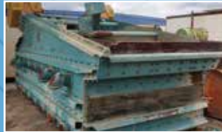
SC3165: 2400 X 4800X2D LUDOWICI MPE SCREEN: Horizontal Style - Complete with Twin 11 KW Motor, Springs & Mounts. Condition: Excellent