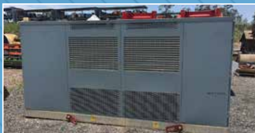
EL3311: 1500 KVA SCHNEIDER KIOSK TRANSFORMER: 11000 to 433 Volts – Dyn11 – Complete with HV RM6 RMU – LV Circuit Breaker & DB Section