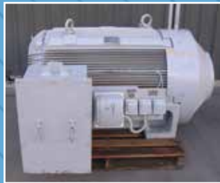
EM4412: 355 KW TECO ELECTRIC MOTOR: 983 RPM - TEFC