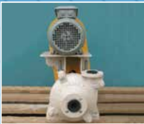
PU3428: 1 x 3/4 ASC Austral Slurry Pump: Condition: New