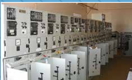
EB3024: YSF6 YORKSHIRE CIRCUIT BREAKER: 12 KV –in both 1250 Amp & 630 Amp – 9 Units Available. Condition: Excellent