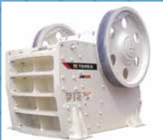
CJ3077: 55" x 32" TEREX JAQUES JAW CRUSHER: Single Toggle - Model JW55. Condition: Unused

We have the largest stock of second hand WARMAN PUMPS in Australia. Offered fully Refurbished in sizes from 1x3/4 up to 20/20. In the following models SC,AH,HH,M,L,D,G,GH,TC,GPS,SP.