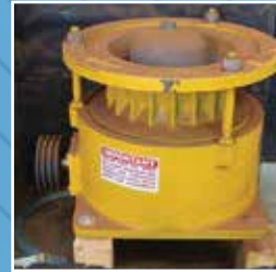
LE3022: 300 WESCON LAB CONE CRUSHER: Model W300-2 - Maximum Feed 50mm - Minimum CSS 2mm. Condition: Unused