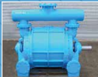
PU3092: CL 2003 Nash Vacuum Pump: Condition: Overhauled