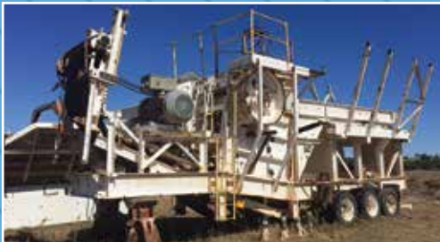
CP3023: 42" x 32" CEDARAPIDS MOBILE CRUSHING PLANT: Complete with Tri Axle Trailer, Feeder, Drive Motor & Discharge Conveyor. Condition: Very Good