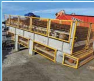
FE3054: 2400 x 7000 MINSPEC APRON FEEDER: 30 KW Planetary Drive – Spill Conveyor. Condition: Unused