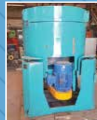
MP3109: 30" XD KNELSON CONCENTRATOR: Model KC-XD30 - Complete with Controller & Valves. Condition: Very Good