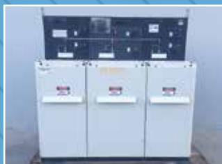
EB3069: RM6 SCHNEIDER RING MAIN UNIT: 12 KV - 630 Amp. Condition: New / Unused