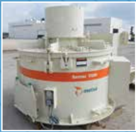
CI3048: VI200 METSO BARMAC VERTICAL SHAFT IMPACTOR: Complete with 132 KW Drive. Condition: Unused